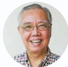
李宗高牧师（博士） 圣经公会华文事工委员会荣誉顾问

（约1:14）就当反思与追究，为何恩典与真理在基督徒实际生活的重要领域上似乎起不了作用。求主帮助我们，使我们能晓得真理，遵循真道，活出恩典来。