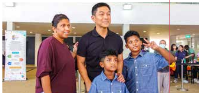
(Left): Fun games were organised to engage the rough sleepers in group activities. (Top Right): A beneficiary receiving ang pao from Love Your (Unseen) Neighbours volunteers. (Bottom Right): ComLink families from Kembangan-Chai Chee attending a year-end festive carnival organised by The Alphabet Project.