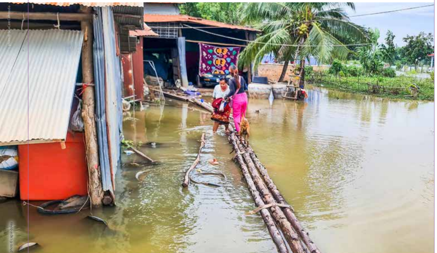
Flash flooding in the lowlands of Kandal province, Cambodia, have caused many homes to collapse, leaving people vulnerable without food and shelter.

Want to contribute to the Global Bible Mission? Scan the QR code to donate or visit donorbox.org/bicentennial .