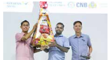
(Top): Guest workers enquiring about the Soft Skill Enhancement Programme (SSEP). (Centre): Guest-worker brothers gather to break fast. (Bottom): A happy winner who won the grand prize in a lucky draw event.