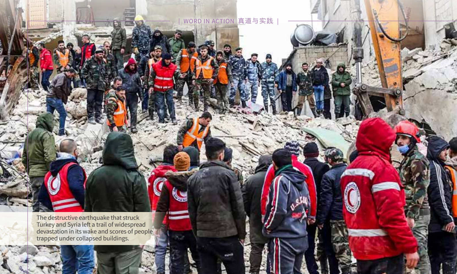
The destructive earthquake that struck Turkey and Syria left a trail of widespread devastation in its wake and scores of people trapped under collapsed buildings.