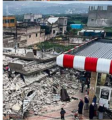
Millions of people in Turkey and Syria have had their homes and livelihoods destroyed and are left displaced.

“... the afflicted need our continued support in this important work of bringing God’s Word to them and bringing hope and transformation into their lives.”