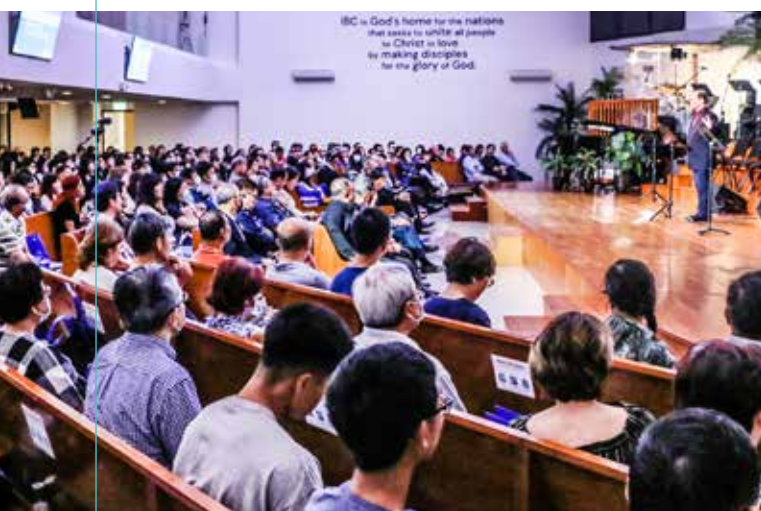
2月18日，超过300人聚集在国际浸信教会参加2023年迈进（GoForth）全国宣教大会的启动仪式。

没有基督肢体的支持，圣经公会的工作就无法完成。因此，200年来上帝的话语蓬勃广传这一非凡的