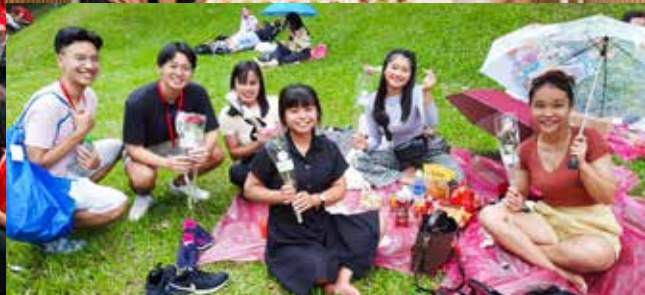
(Left): ADEO members were all smiles after receiving appreciation cards handmade for them by volunteers from S-Word EFC Youth Fellowship. (Top Right): S-Word EFC Youth Fellowship, a partnering church with SowCare, blessed the MDWs with baked treats and handmade cards for Valentines' Day. (Bottom Right): ADEO partnered with youth volunteers from NUS Raffles Hall (Tennis Club) in handing out flowers to MDWs at Fort Canning Park, in lieu of International Women's Day.