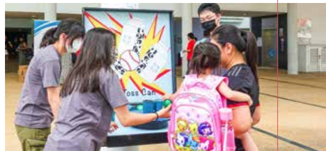
(左): 爱你 (未见) 的邻居受益人从志愿者手中接过祝福红包和礼包。(右上): 与露宿者玩游戏以增加互动。(右下): 来自景万岸-菜市的社区联系站 (ComLink) 家庭参加由“启蒙计划” (The Alphabet Project) 举办的年终节日嘉年华会。