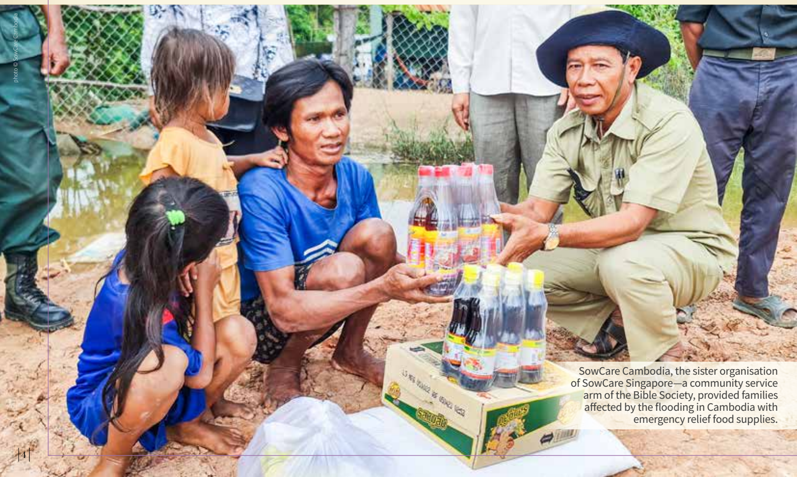
SowCare Cambodia, the sister organisation of SowCare Singapore—a community service arm of the Bible Society, provided families affected by the flooding in Cambodia with emergency relief food supplies.