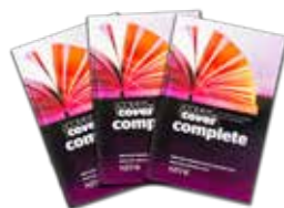
Each winner received the Cover to Cover Complete One-Year Chronological Reading Plan (NIV) which helps readers develop a well-balanced Bible-reading plan.