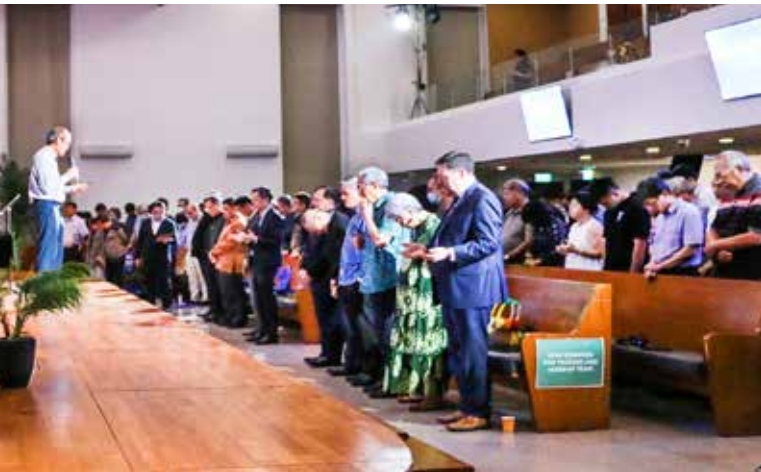
On 18 February 2023, over 300 believers gathered for the commencement service at the International Baptist Church to kickstart the GoForth National Missions Conference 2023.