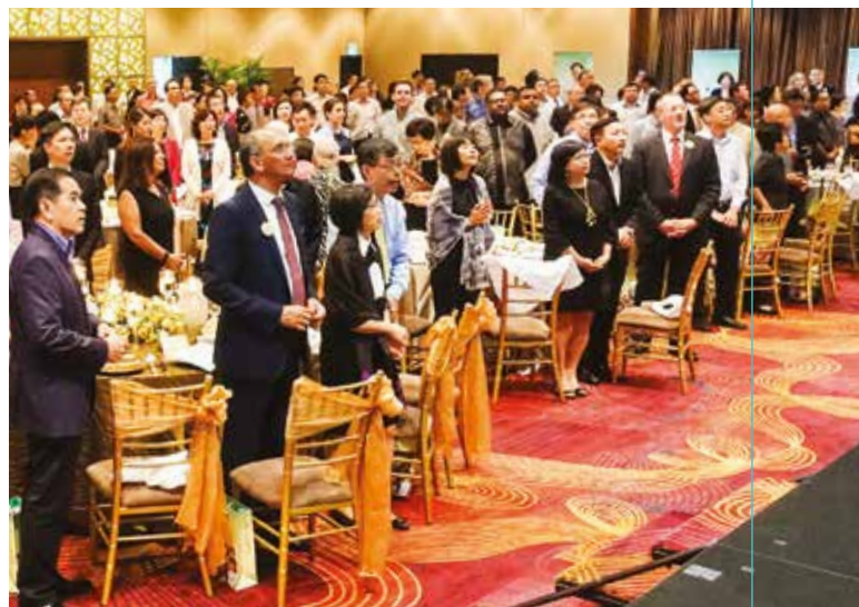
The Bible Mission Banquet—a yearly fundraising initiative by the Bible Society—will be held on 7 July, where the bicentennial of the Bible Mission in Singapore will also be honoured.

Our work cannot be done without the support of the Body of Christ, therefore this remarkable milestone of the Word of God flourishing for 200 years is not just a celebration for the Bible Society, but rather ours