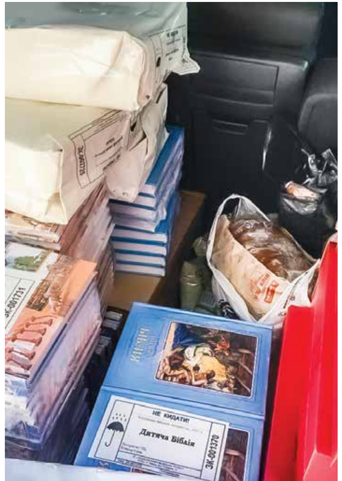
(Left): Volunteers distributing food and basic supplies to refugees at the Ukrainian border. (Right): A staggering number of Ukrainians have requested for Bibles and Scripture materials to be distributed.

aid agencies are trying to meet the astounding needs of these refugees, most of whom are women and children. Over 7.7 million people are also internally displaced within Ukraine, forced to take refuge in safer regions or in subway shelters. Many elderly or disabled people and other vulnerable populations that don't have the ability to flee are left behind.