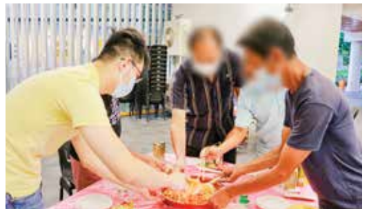
(左): 中区市长潘丽萍女士和希望工程联盟主席陈业伟牧师向贫困老人派送生活用品。(右上): 爱你 (未见) 的邻舍行动的志愿者们一起为社区做善事。(右下): “耕心”与亚美尼亚社区安宿处的露宿者欢庆农历新年。