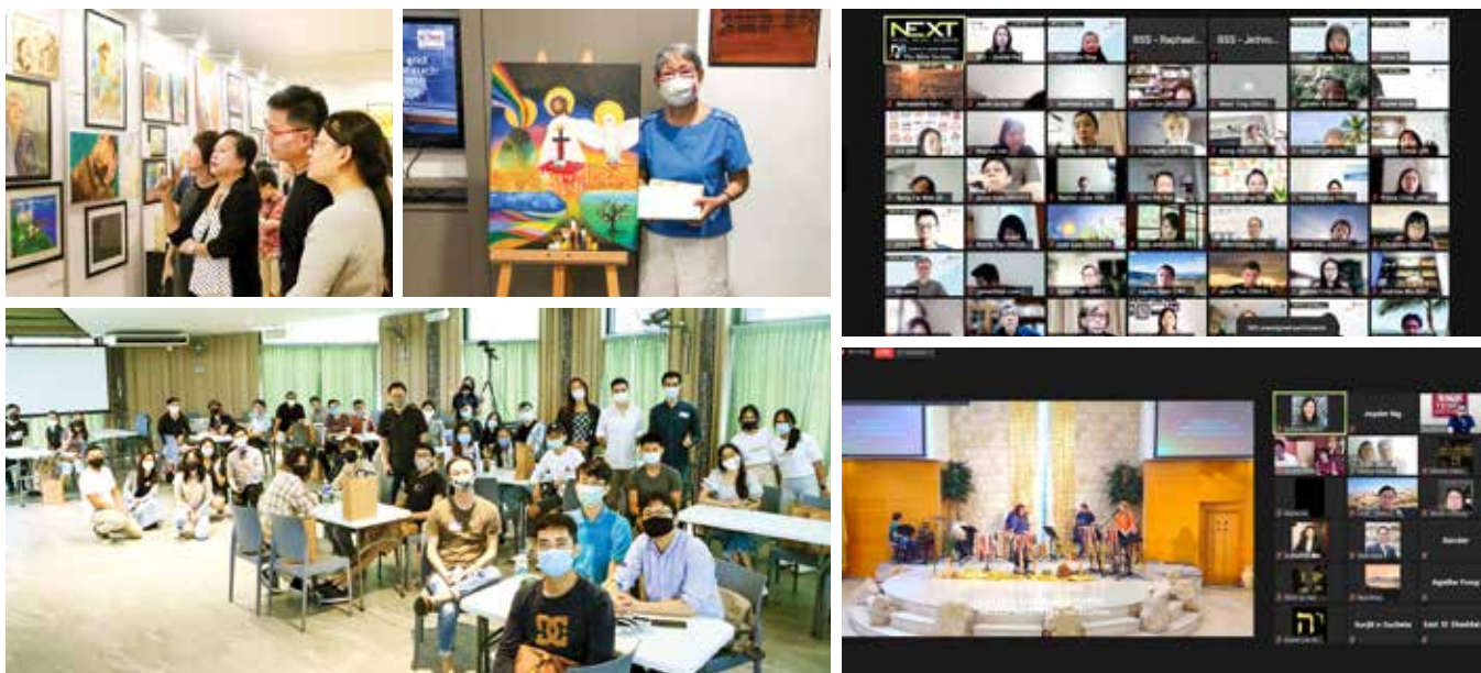
(Top Left & Centre): Colours of the Bible —an annual art competition and exhibition—will be held throughout the year. (Bottom Left): YOUTH-reka is the first of many initiatives that the Youth Ministry of the Bible Society has organised for this year. (Top Right): The annual conference of D6 2022 will follow the theme of ReCalibrate this year. In 2021, over 520 local and overseas participants joined the online conference on Zoom. (Bottom Right): DECLARE —a national Bible reading event—will be held in June this year.

everyone to take on life's challenges and live the life that God has intended us to live. On that note, the Bible Society has relaunched in-person Bible engagement programmes in April, following two years of shifting to digital initiatives due to COVID-19 regulations.