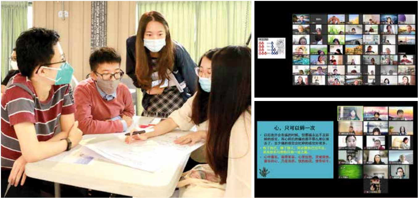
(Left): Passionate youths and youth group leaders gathered to explore youth and faith related topics at YOUTH-reka. (Right): Virtual lectures and workshops were conducted by the Chinese track of Sower Institute for Biblical Discipleship during the pandemic.