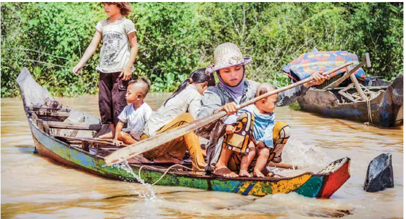
The Bible Society has raised nearly $20,000 in funds to provide humanitarian relief to the Asian countries impacted by floods.

Want to contribute to the Global Bible Mission? Scan the QR code to donate or visit bible.org.sg/donate .