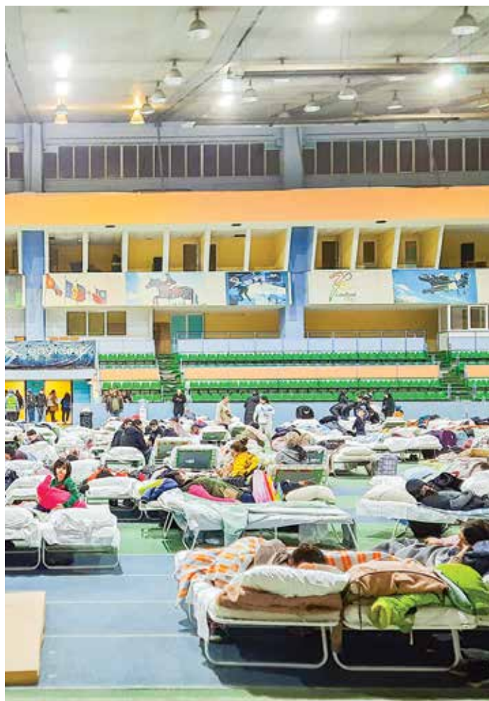
(左) 志愿者们在乌克兰边境向难民分发食物和基本用品。(右) 乌克兰难民在摩尔多瓦的一个难民收留中心寻求庇护。

一直在努力满足这些难民的巨大需求，其中大多数是妇女和儿童。乌克兰境内也超过770万人流离失所，被迫到更安全的地区或地铁里的庇护所避难。许多老年人、残疾人和其他没有能力逃离的弱势群体只能留在危险区域。