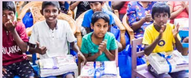
(Bottom Left): The Bible Society is actively involved in the preparations of GoForth 2023, which aims to reach out to the Christian community and pre-believers through a missional approach. (Top Right): Ukrainian civilians whose area was under regular shelling received food sets and Scriptures. (Bottom Right): In Sri Lanka, books and stationeries were distributed to disadvantaged children in literacy programmes.