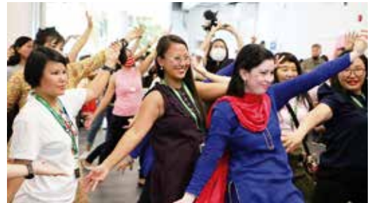
(Left): Talent Showcase is organised for the MDWs as part of the monthly outreach (Top Right): The MDWs folding origami hearts to form a Rangoli (Bottom Right): Electrifying zumba session with the MDWs to keep them healthy and active