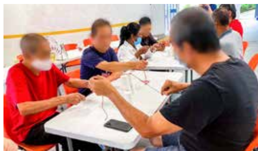
(Left): All the kids who participated in ComLink Read. Write. Tell (RWT) Guided Challenge receiving appreciation. (Top Right): A beneficiary receiving care packs from Love Your (Unseen) Neighbours volunteers. (Bottom Right): Fun games were organised to engage the rough sleepers in group activities.